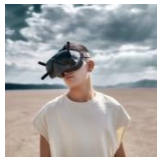
Head Mounted Displays